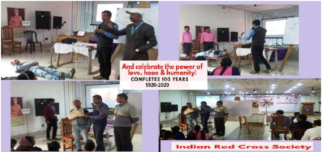
Indian Red Cross Society proudly celebrates 100 years of their existence on the platform of Rajendra Academy for Teachers' Education, Durgapur